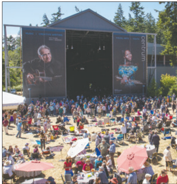
Summer Concerts at Centrum in the McCurdy Pavilion